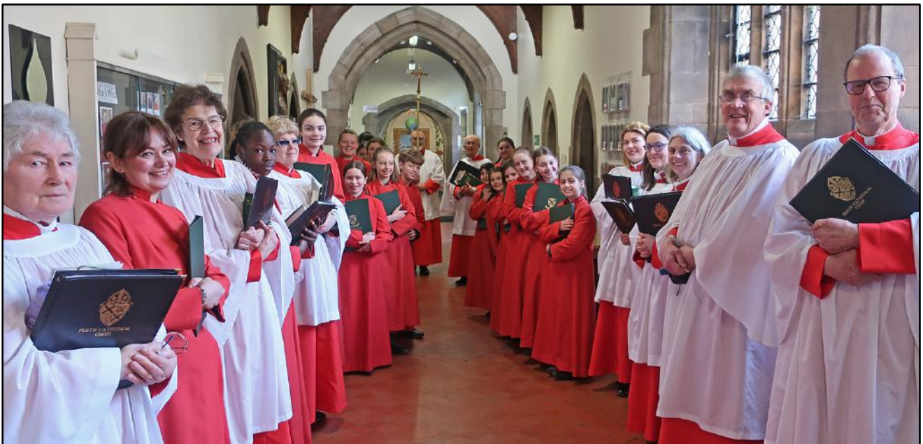
The Cathedral Choir, with the choristers of Ardvreck School, before the start of a morning service

The director of music works closely with the Provost and ministry team to prepare the liturgy, music and orders of service throughout the year. The director of music serves as both organist and choirmaster, assisted by an experienced conductor and organ scholar. The choir sings a wide range of traditional and contemporary church music.