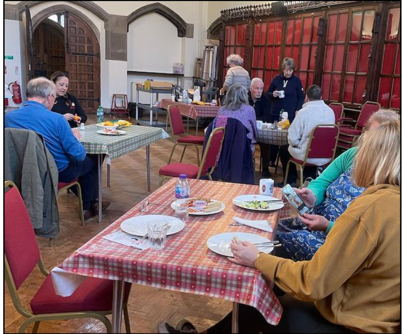
Our 'warm space' volunteers have provided hot drinks and lunches to the Perth people over the past two winters

The Cathedral has an active website and Facebook presence, which are regularly updated, to promote services and activities within the Cathedral. Our monthly Cathedral magazine is available both online and in print.