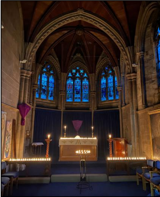
Mundy Thursday vigil in the Lady Chapel

The main Cathedral service on Sunday is the Sung Eucharist at 11.00am. This service of Holy Communion follows the seasonal variations of the Scottish Liturgy 1982, as revised in 2022 and using inclusive language.