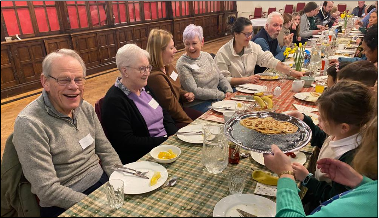
Shrove Tuesday 2024 pancake party in the Chapter House

members. Groups from the congregation enjoy social meetings, cultural evenings and trips to places such as Pitlochry Theatre.