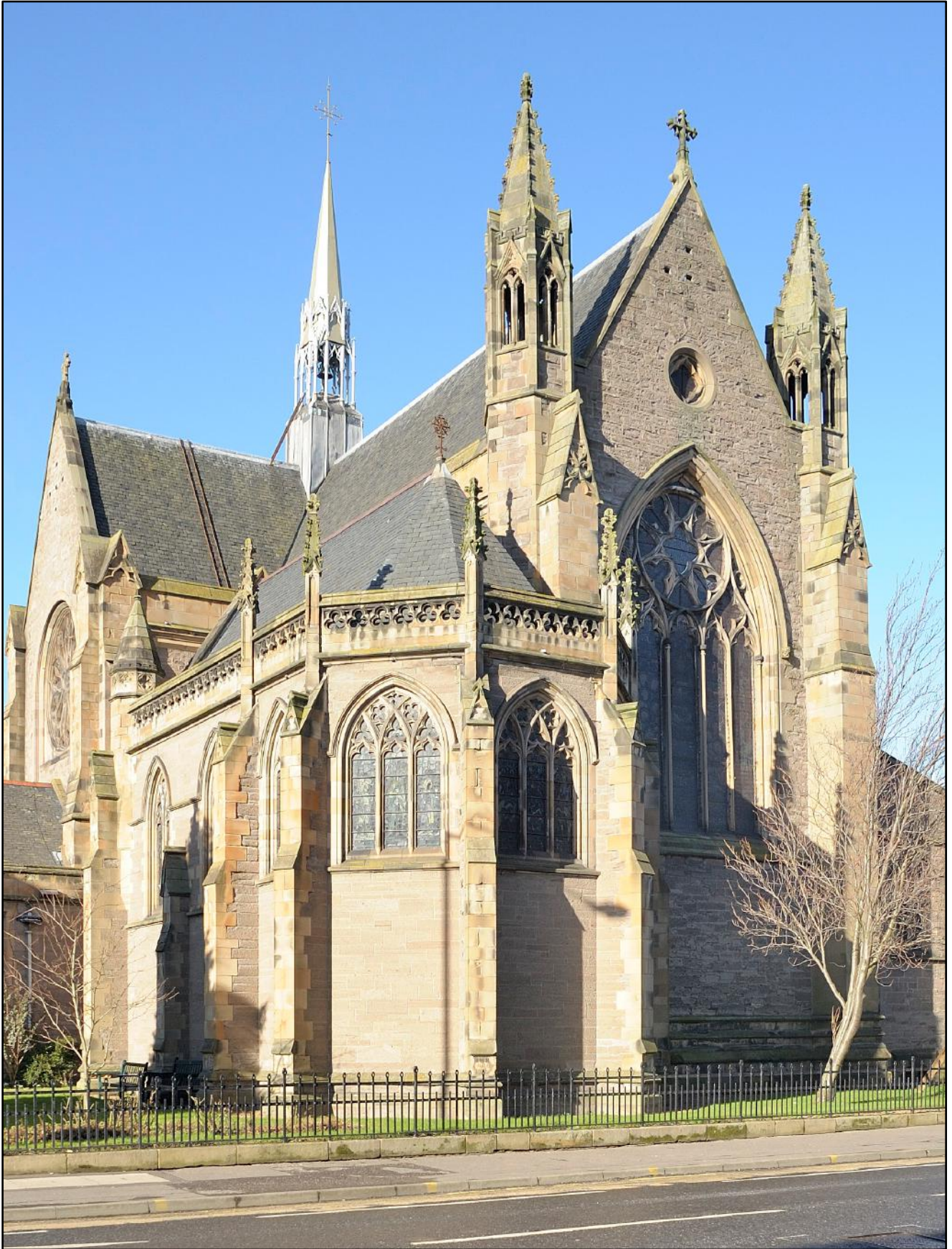
Exterior view of the Cathedral