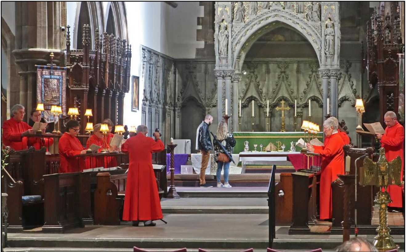
Doors Open Day 2023. The Choir sings while visitors admire some of our 'treasures'